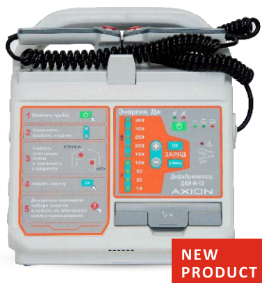
Defibrillator DKI-N-12 "Axion"