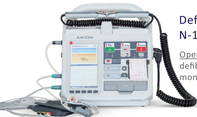
Defibrillator - Monitor DKI- N-11 "Axion"

Operating mode: manual defibrillation, monitoring