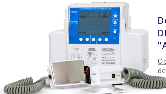
Defibrillator DKI-N-10 "Axion"

Operating mode: manual defibrillation, monitoring